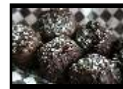
Double Chocolate Brownie Bites (6) Warm & Yummy $4.49