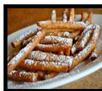
Funnel Fries (20) --$4.49