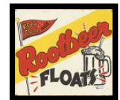
Big Triple Scoop Rootbeer Float $3.99 (Topped with whipped cream & cherries) Junior Size - $2.99