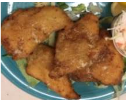
Traditional Fried Cod Dinner

We do however offer an EXTRA LARGE PORTION (5 nice sized pieces) for $4 more.