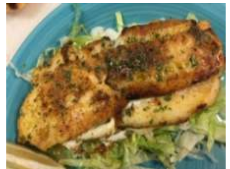
Baked Cod Dinner

(A bolder batter with a slight beer flavor)