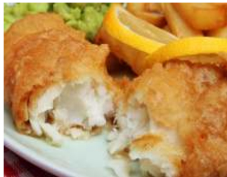
Beer Battered Fried Cod Dinner

(A lighter breading fried to a golden brown)