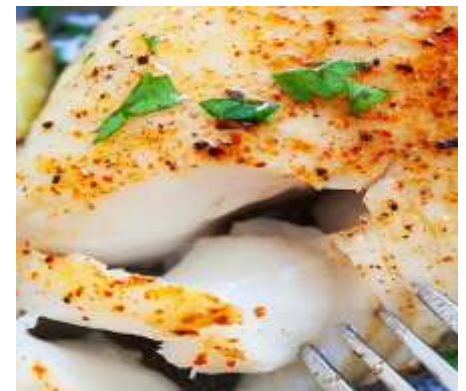
Traditional Fried Cod Dinner

(A lighter breading fried to a golden brown)