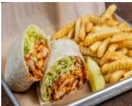
Buffalo Chicken Wrap