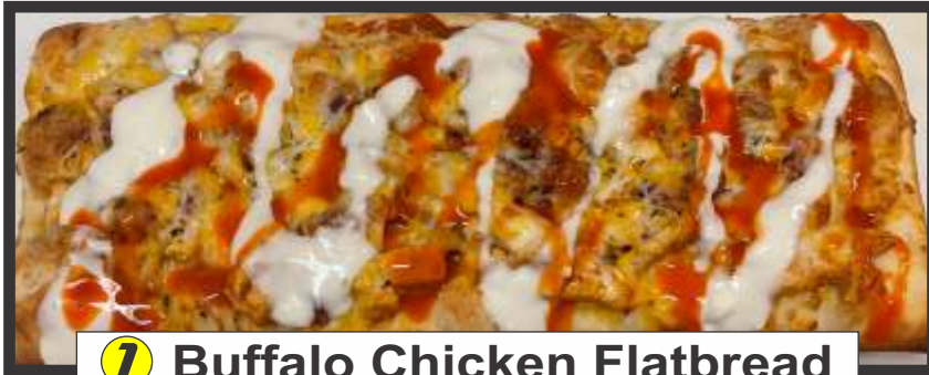
1 Buffalo Chicken Flatbread