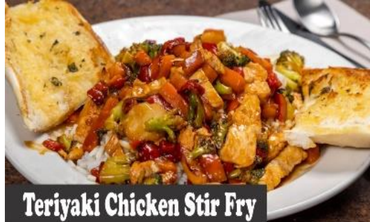
Teriyaki Chicken Stir Fry

Grilled chicken and Asian vegetables mix with Teriyaki sauce served on a bed of rice. Served with Garlic bread.