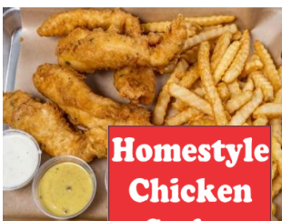
Homestyle Chicken Strips