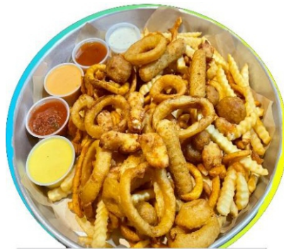
Combo Platters Contain: Cheese Sticks, Cheese Curds, Savory Fries, Crinkle Cut Fries & Onion Rings.