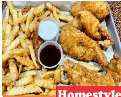
Homestyle Chicken Strips