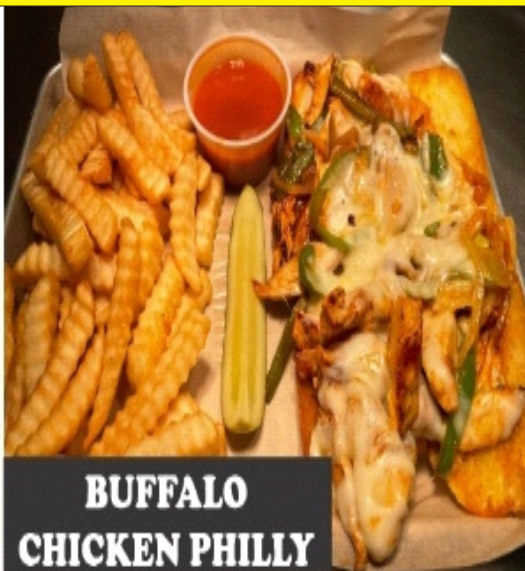
BUFFALO CHICKEN PHILLY