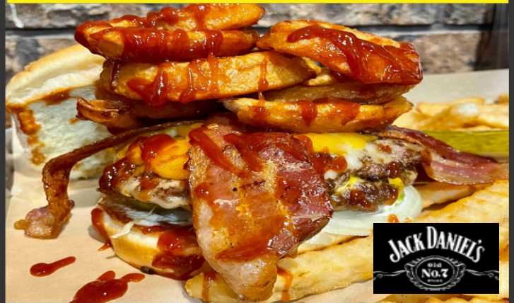
Whiskey Glazed Western Burger

Burgers served with choice of Specially Seasoned Crinkle Cut Fries, or Tator Tots. Sub Curly Fries +1, Onion Rings +1.50 or Side Shooter Fries +2.50