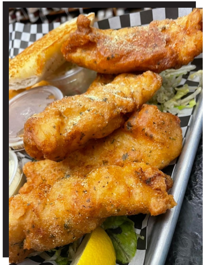
Beer Battered Fried

Baked Cod 4 piece - 16.99 (a 12 oz. serving)