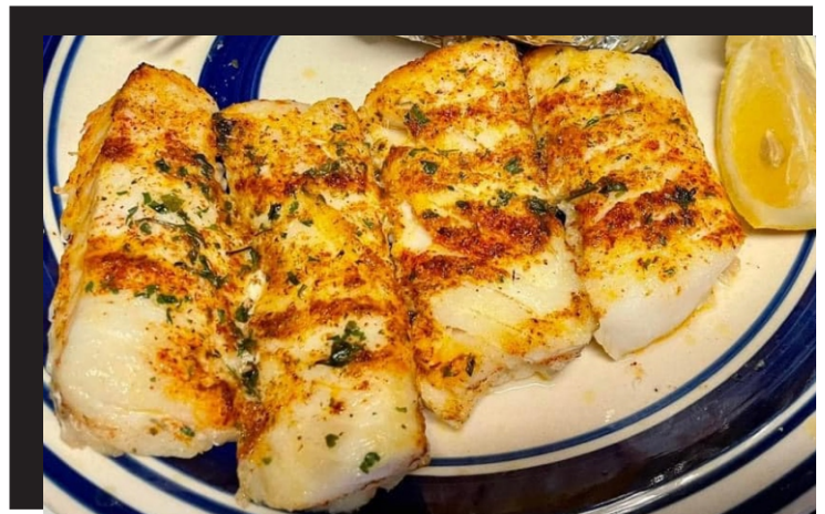
Baked Cod Dinner